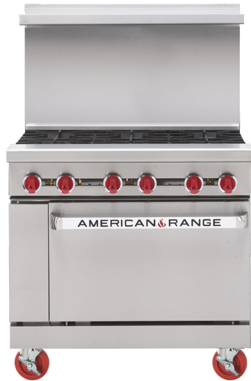
Model Shown ARGF-6