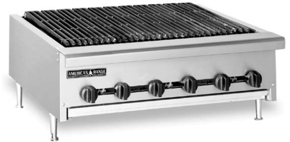
ARRB-36 Shown with optional 4" counter legs