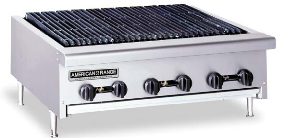
AERB-36 Shown with optional 4" counter legs