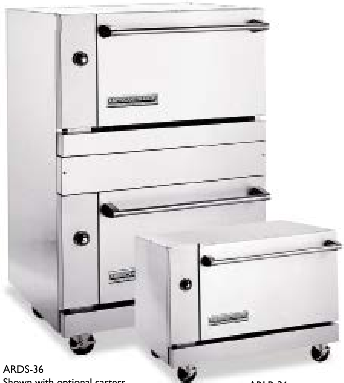
ARDS-36 Shown with optional casters.