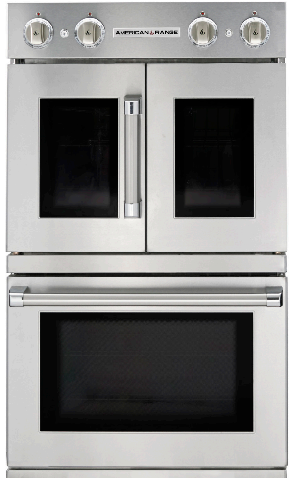
DEFC-30 SHOWN IN STAINLESS STEEL, AVAILABLE IN ANY RAL COLOR