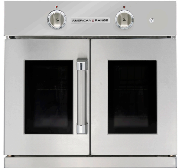
SEF-30 SHOWN IN STAINLESS STEEL, AVAILABLE IN ANY RAL COLOR